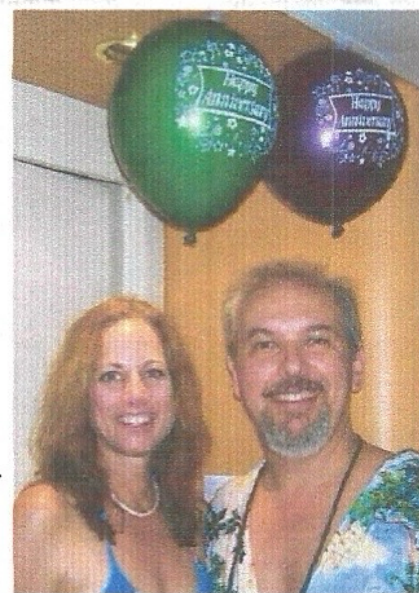
Anniversary balloons outside the stateroom door.