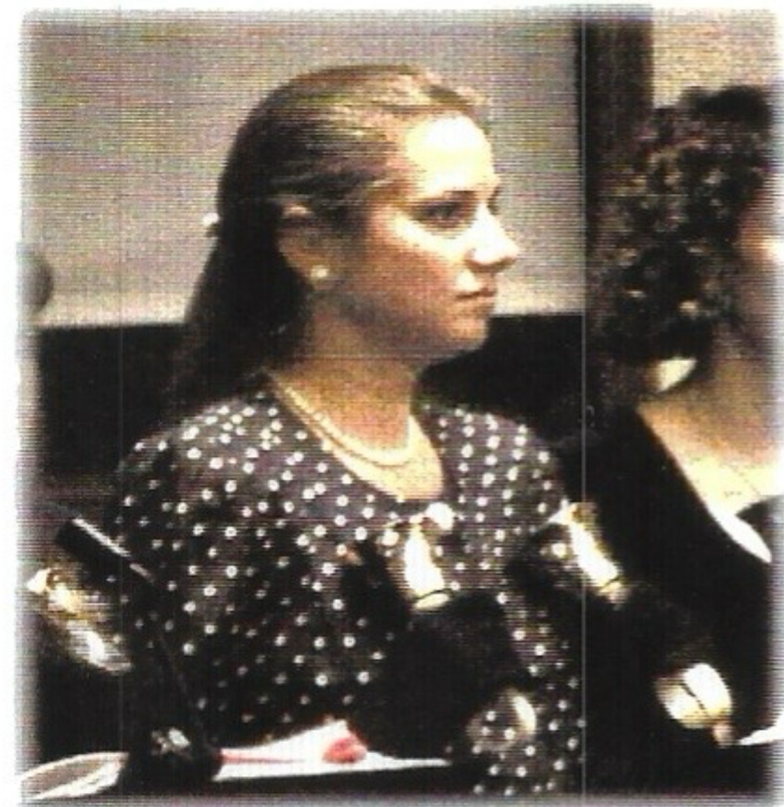
Handbell playing seems to be serious work!