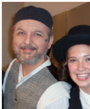
The Butcher, Lazar Wolf