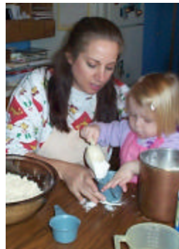
Baking with a Visitor